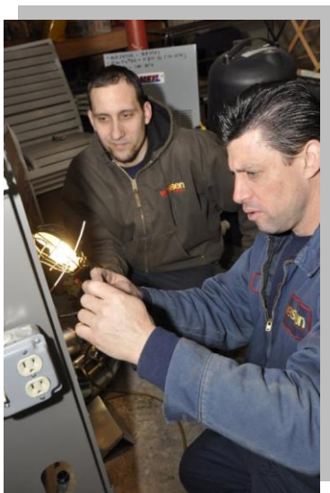
Schedule Wesson Energy's experts for your annual clean, tune and test